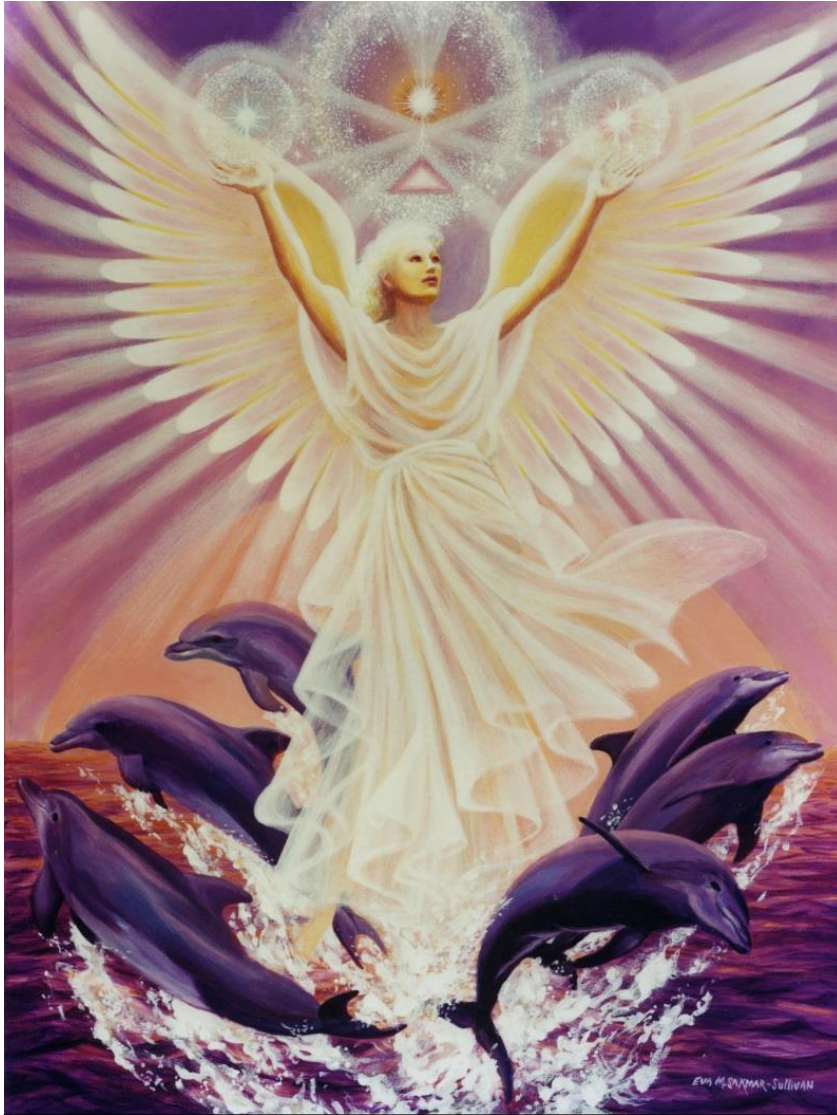
Soul Detective Practitioner Card Deck