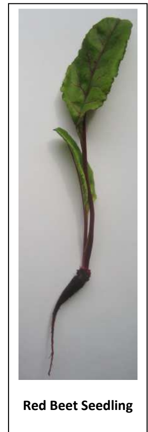
Red Beet Seedling